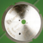
HARDIEBACKER® SAW BLADE

Cutting of boards can be performed by scoring a line and snapping the board upwards using a straight edge.